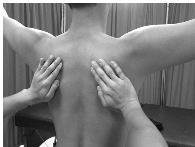
Fig. 2. Palpation method of scapular dyskinesis classification test. For the palpation, the radial hand side of the rater firmly contacted the medial border and inferior angle of the scapula bilaterally, and the 2nd to 5th fingers were placed on the spine of the scapula with the 3rd fingertip on the root of the spine of the scapula.

After signing the consent form, male participants were asked to remove their shirts, and females were asked to wear halter tops. Subjects were instructed to practice arm elevations in the scapular