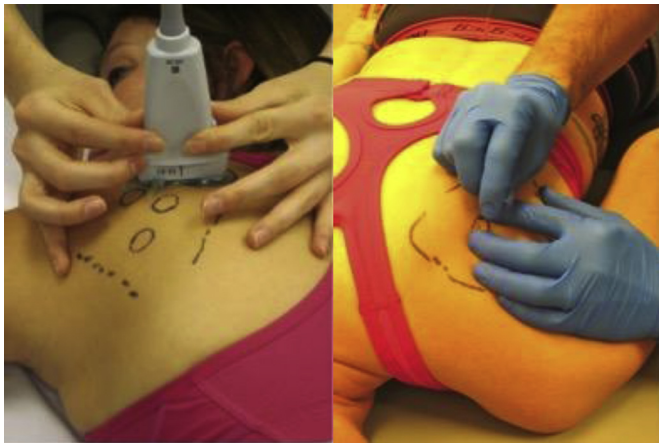
Fig. 1. Location of ultrasound imaging transducer, pain algometry, and dry needling treatment. Pain algometry measures and dry needling treatment was performed at the most painful areas of the superior, medial, and inferior infraspinatus muscle of each side for each participant.

the center of the image at a later time using Image J software (V1.38t, National Institutes of Health, Bethesda, Maryland) by an examiner who was blinded as to whether the image was from the symptomatic or asymptomatic side and before or after dry needling.