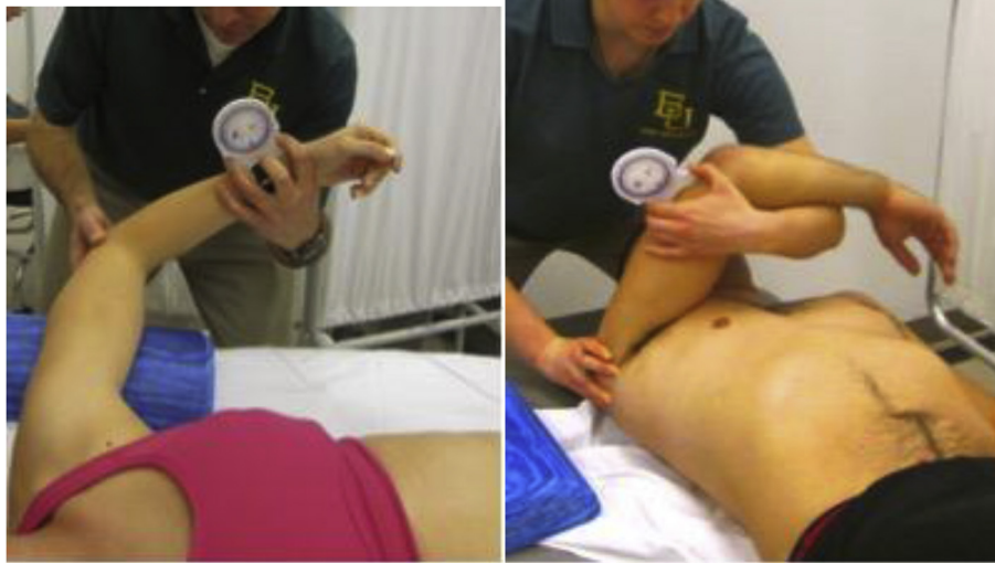
Fig. 3. Shoulder joint internal rotation and horizontal adduction range of motion.

abnormalities in nociceptive processing or hyperalgesia (Ylinen, 2007; Sterling, 2011). A digital pressure algometer (Wagner Force 25 FDX, Wagner Instruments, Greenwich, CT) was used to measure pressure pain threshold, which has been found to be highly reliable and responsive to change, especially when taken by the same rater (ICC = 0.94 to 0.97, Minimal Detectable Change [MDC] = 4.3–9.8 N/cm 2 ) (Walton et al., 2011). Measures were taken at the same three locations in each infraspinatus muscle as dry needling (Fig. 1). The algometer was held by an examiner directly perpendicular to the muscle belly of the infraspinatus and was advanced at a rate of approximately 5 N/sec. Participants were instructed to verbally signal when they first perceived the force exerted as painful or uncomfortable. Pressure pain threshold at each location was taken three times and averaged to reduce variability. The measurement locations were marked with a surgical marker to ensure reassessment measures were taken at the same location.